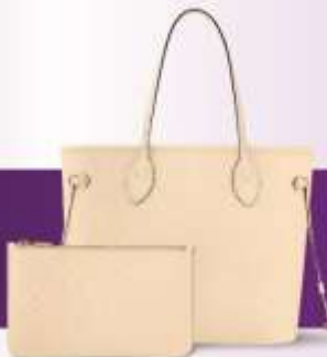
Opportunity Drawing The Louis Vuitton Neverfull MM Tote Bag

Camp Agape is dedicated to providing support for children afflicted with cancer and their families. This beloved ministry offers a compassionate and caring environment, exemplary of Christ's unconditional love, along with an opportunity to shape meaningful friendships and create precious memories.