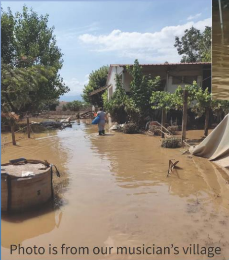
Photo is from our musician's village