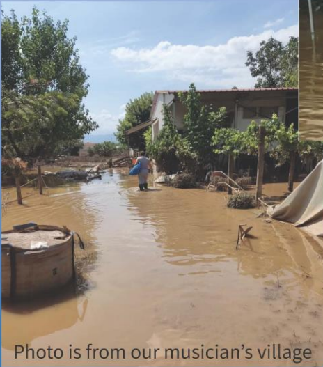
Photo is from our musician's village